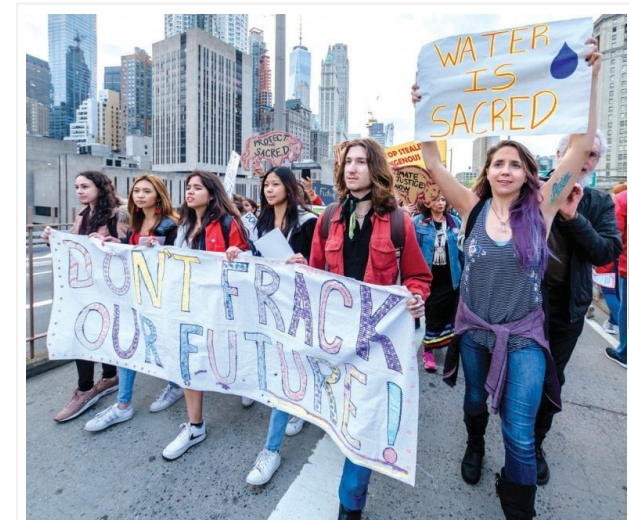
Demonstrators sent a message to Gov. Andrew Cuomo to "Walk the Talk."